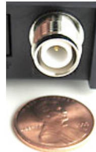
RP-TNC Female Connector