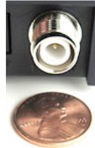
RP-TNC Female Connector